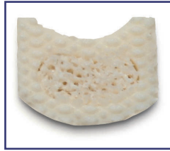
Cervical Spacer with Cancellous