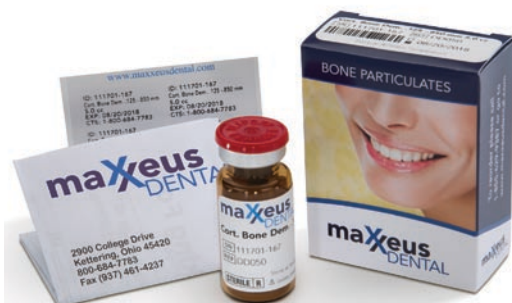
Maxxeus Dental Packaging

*Additional allografts and sizes may be available upon request; please consult a Customer Service Representative for details.